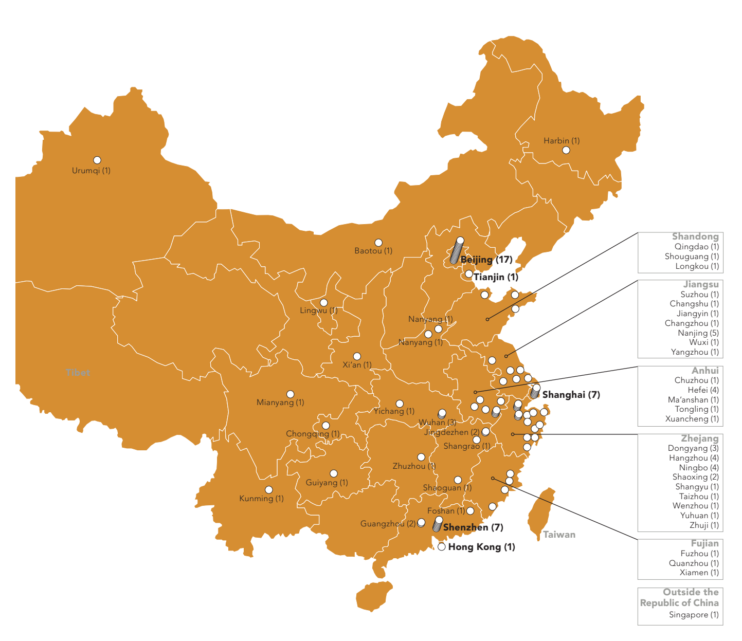
Figure 2: Headquarter locations of China's next 100 global giants